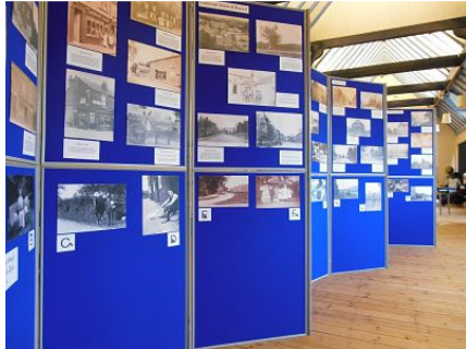
(Part of the display)