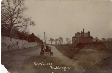
(One of the new photographs)