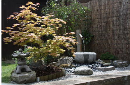
(‘A quiet corner of Japan in Ruddington’ – the winning photographic entry)

It was with regret that the Parish Council cancelled the Garden Competition Presentation Evening as a result of so many prize winners being unable to attend. It was a very successful evening last year and it is anticipated that in future this event will take place before the school half-term which hopefully will mean more people available to attend.