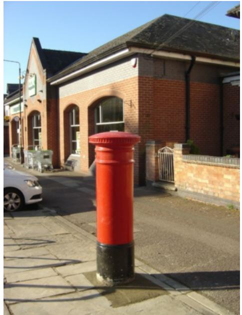
The new post box just along from the Co-op.